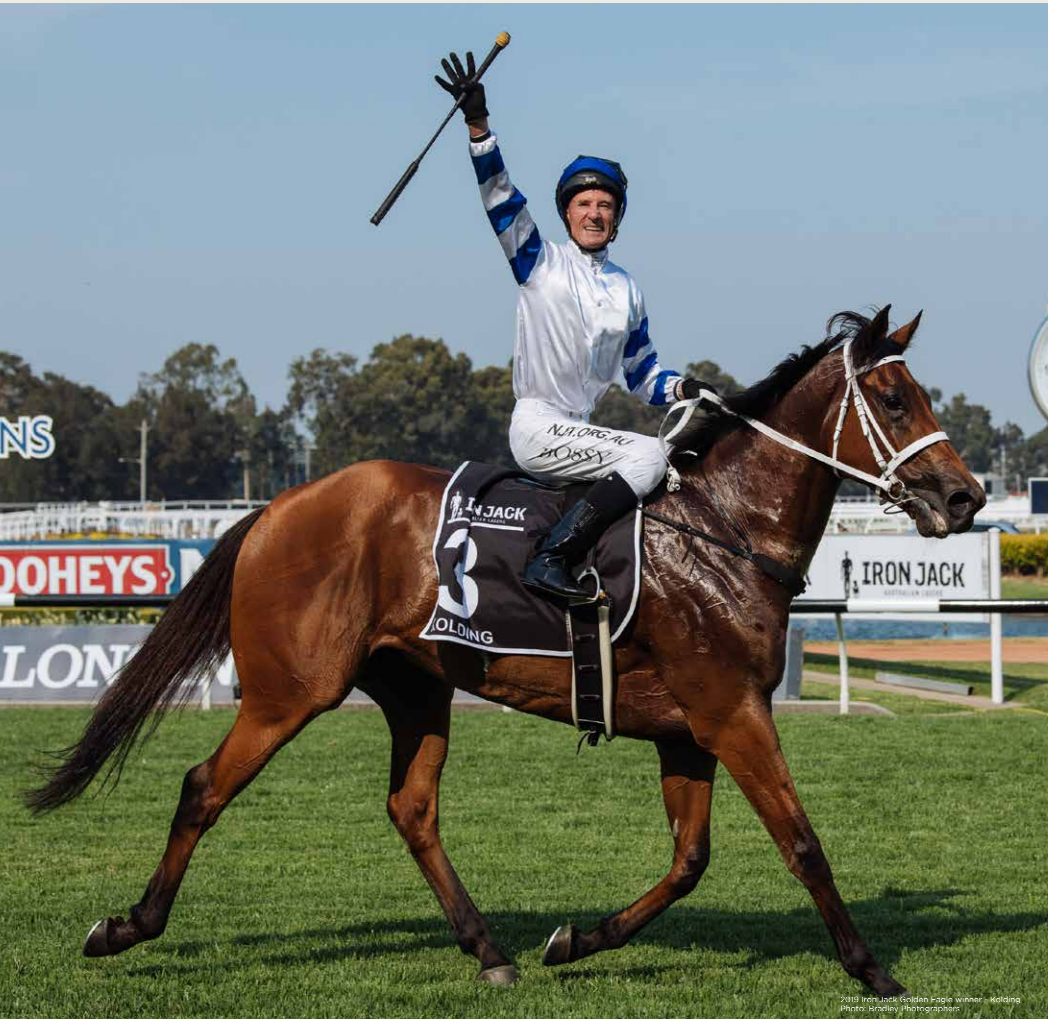
2019 Iron Jack Golden Eagle winner - Kolding