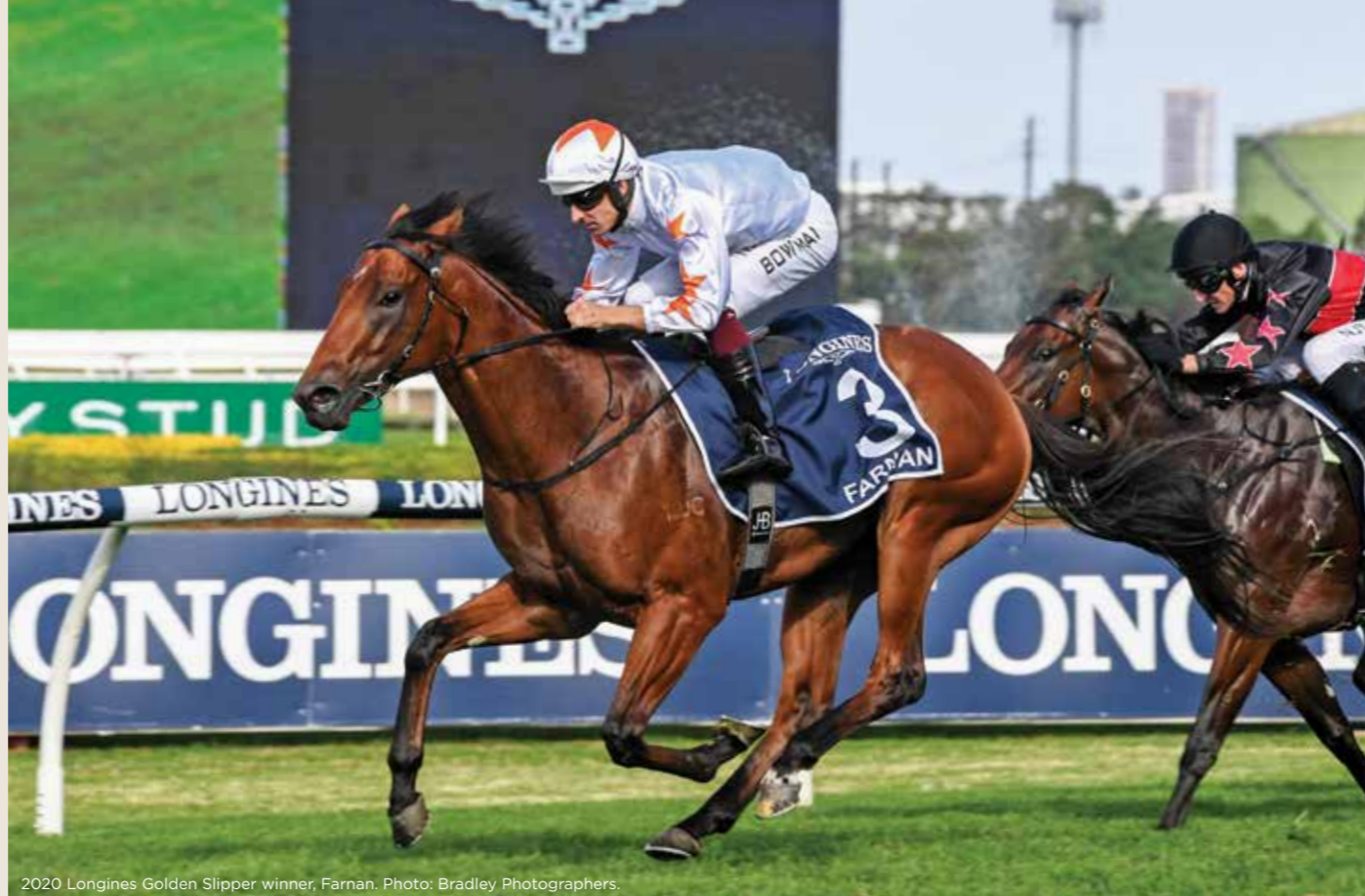
2020 Longines Golden Slipper winner, Farnan.

First, second and final acceptances must be lodged when due or the Longines Golden Slipper entry will lapse.